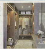
Essex Holder's Green Price: £3.8million

With two dressing rooms, this is the ultimate pad in which to get ready for a party. The three-bedroom apartment, which is lateral and full of light, has been renovated by Hicky and Rigby. There is even Latron lighting, to check your outfit works in all light. Agent: Carter Jonas (020 3731 4856, carterjonas.co.uk)