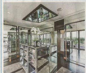
South Kensington Harrington Road Price: £8,000 per week

which are currently being used as a self-contained flat, as well as a detached cottage. The house has exposed beams and a grand entrance hall, and the master bedroom has a large dressing room, which is filled with light. Agent: Mullick Wells (01279 755400, mullicks.co.uk)