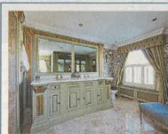
Brighton Arundel Terrace Price: £3million