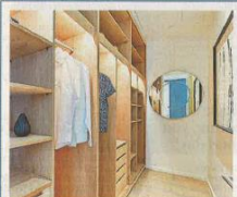
Nine Elms Embassy Gardens Price: £4.5million

In one of Brighton's most famous Regency terraces is this five-bedroom house with views straight out to sea. The white stucco property is made up of the main house, plus three separate self-contained apartments. The grand house has wood panelling, high ceilings and elegant, old-fashioned interiors. There is a small back garden and a large roof terrace. Agent: Mignon Mackay (01273 670067, m@hommackay.com)