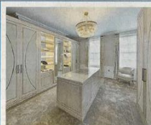
Westminster Queen Anne's Gate Price: £19.5million

and a spiral staircase to connect the two floors. On the top floor there is a terrace, and residents have access to a swimming pool, gym and cinema room in the complex. Agent: Johns & Co (020 7481 0600, johns@jc.co.uk)